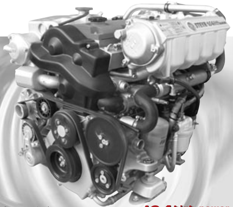
Hydraulic pump optional